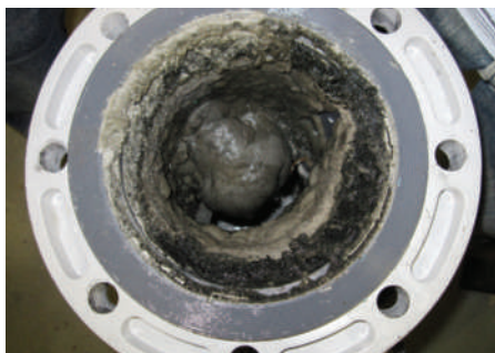
Struvite build-up in water-treatment pipes could be a valuable source of phosphate.

"The bottom line is that it will just cost more to eat," says Rosemarin. "There will be no cheap lunches any more."